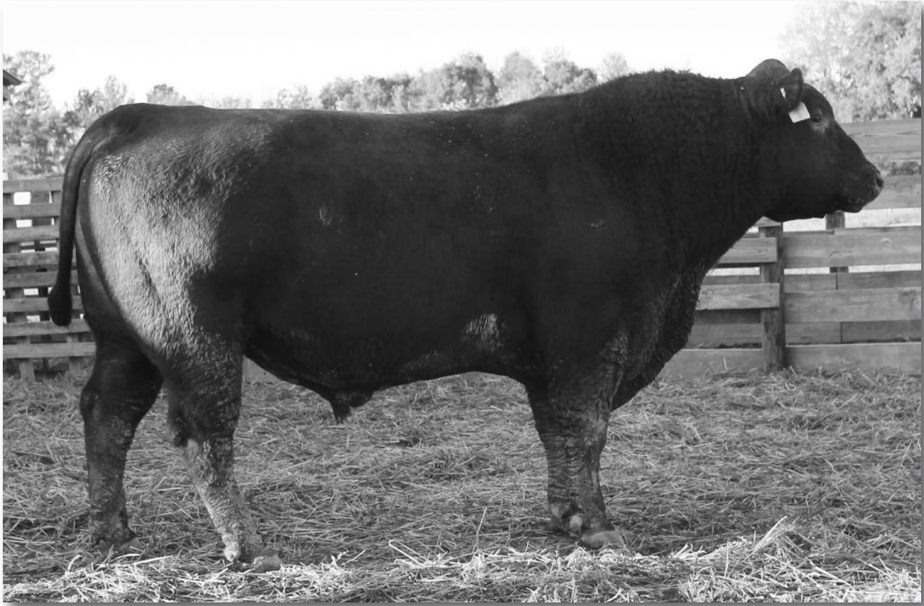
Andras Thunder 2082 • Lot 1