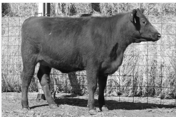
JEM Roxie 129C • Lot 34

Lots 34 – 60 are yearling open heifers and many are ready to breed as soon as you get them home.