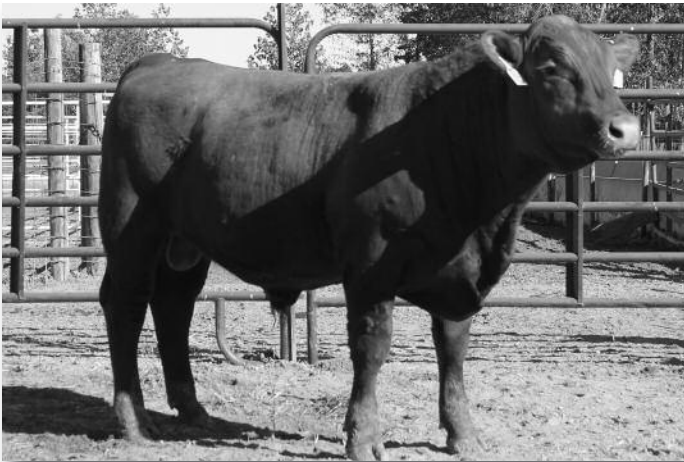
FOR348CNWPQ • Lot 27