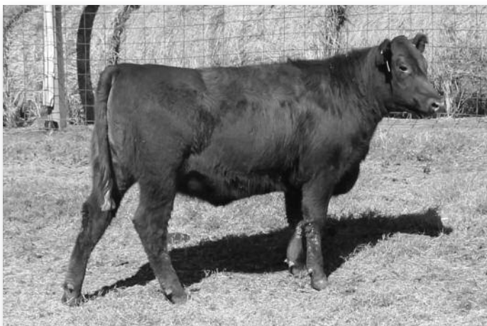
JEM Lillie 130C • Lot 42