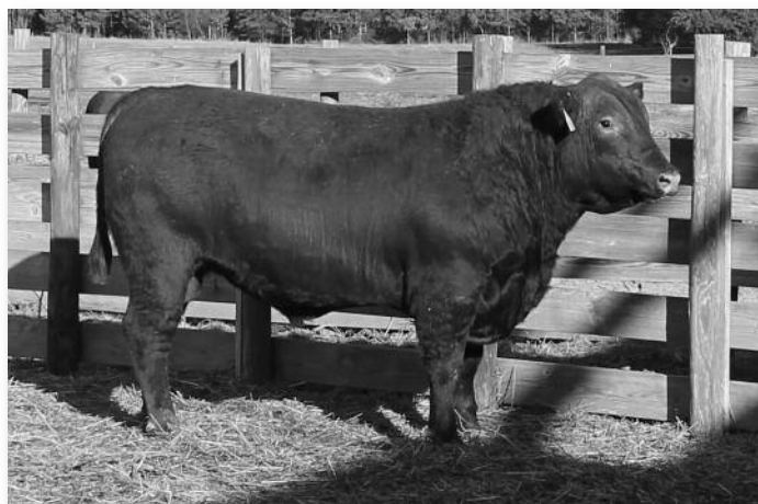
Osborn Thunder 1511 • Lot 9