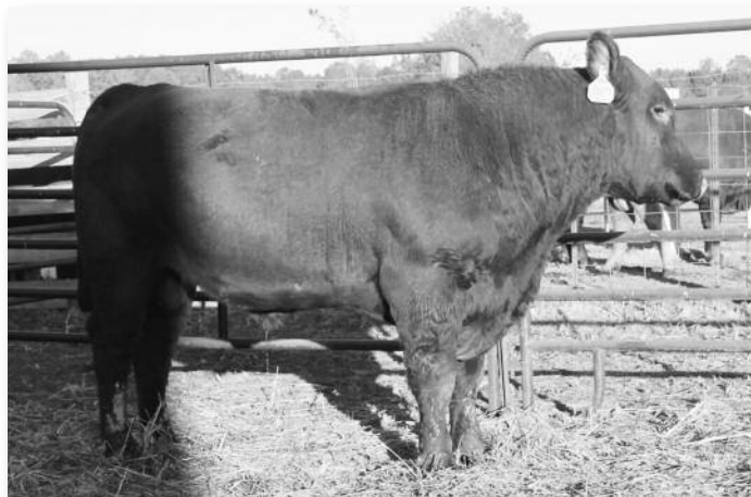
Osborn Thunder 1533 • Lot 15