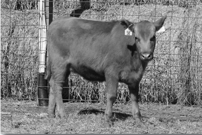
JEM Dynette 150C • Lot 58