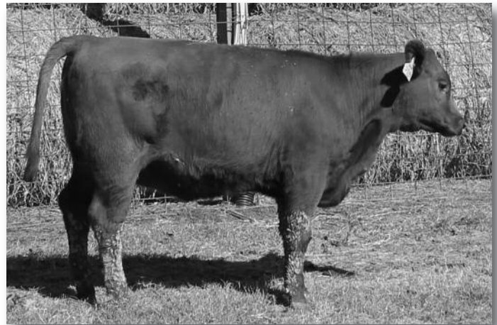
JEM Robin 142C • Lot 45