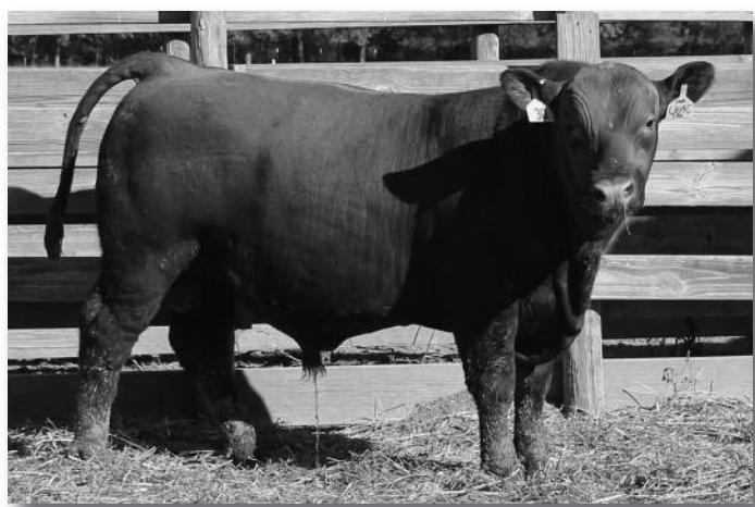
FORU64C T30 • Lot 30