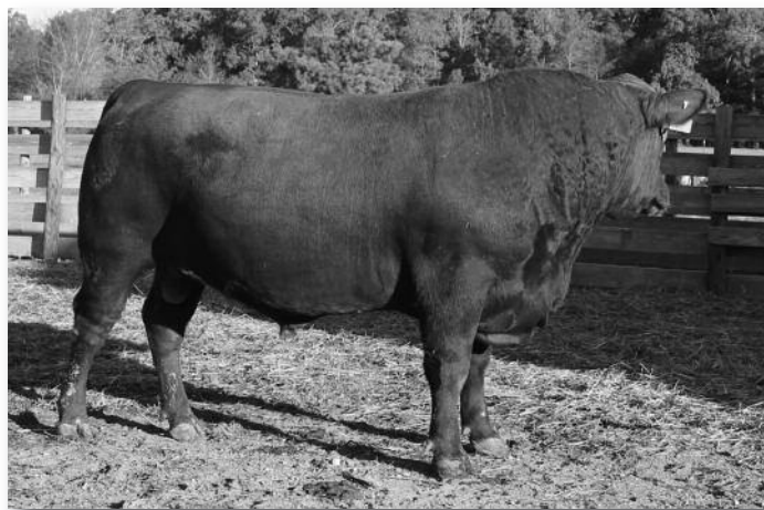
Osborn Thunder 1521 • Lot 16

Lots 17 – 33 are yearling bulls and have been raised with a TMR of alfalfa hay, and mixed grains.