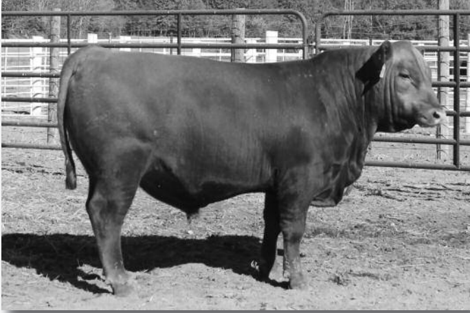
JEM Legend 135C • Lot 26