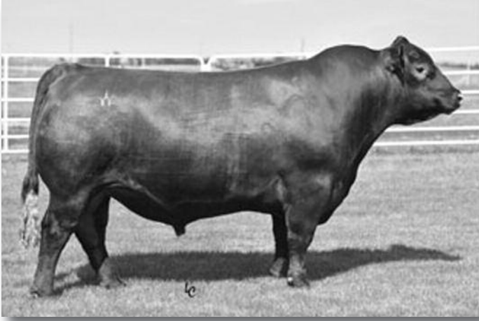
Andras New Direction R240 • Sire of Lot 18