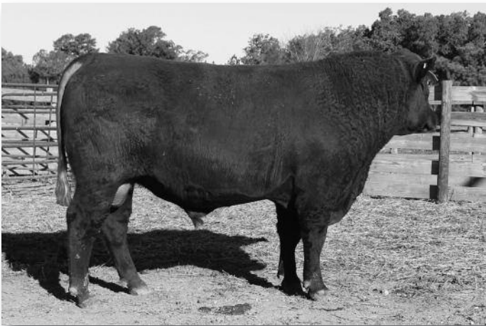
JEM Thunder 1527 • Lot 5