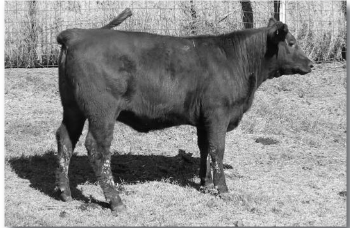
Commercial Heifer • Lot 44