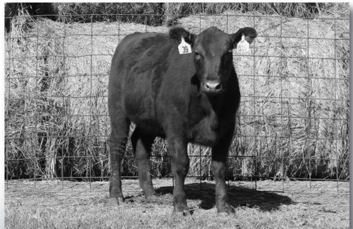
JEM Sara 141C • Lot 39