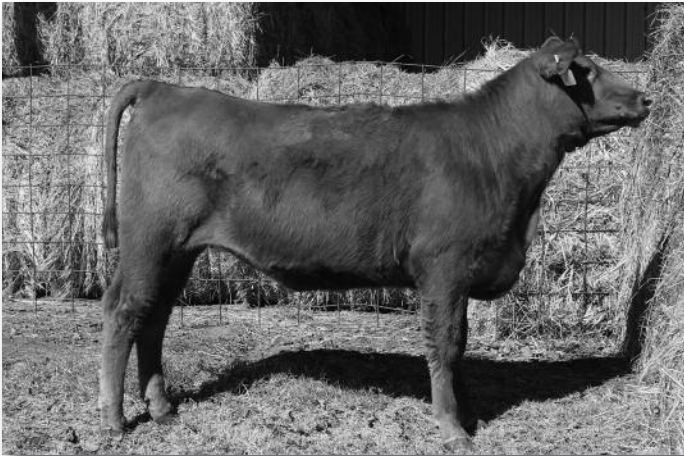
Scots Mimi XT • Lot 49