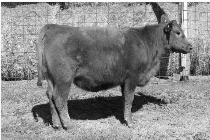
Osborn Omak 113C • Lot 41