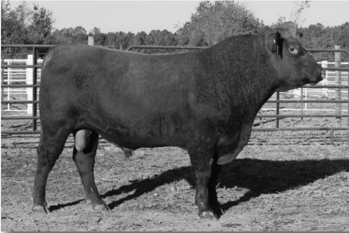
Osborn Thunder 1515 • Lot 4