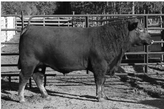
JEM Thunder 1514 • Lot 12