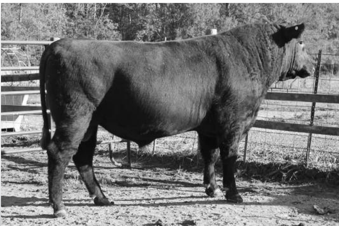
Osborn Thunder 1526 • Lot 6