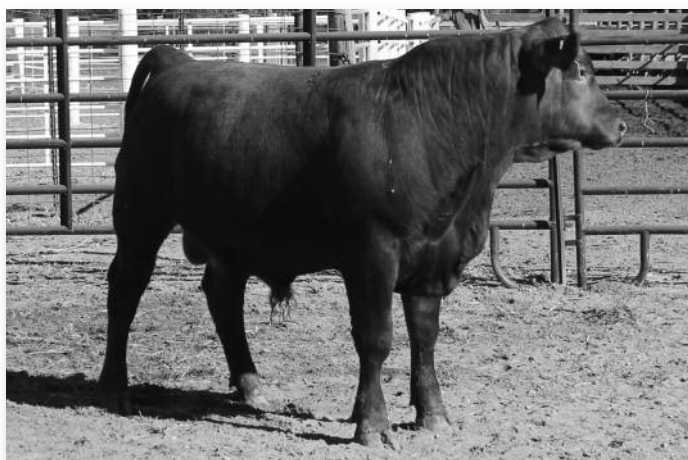
Osborn Legend 106C • Lot 33