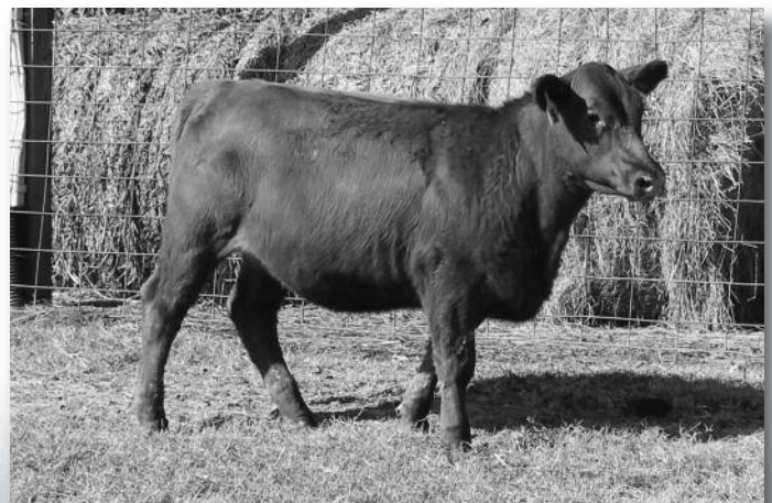
JEM Sara 122C • Lot 56