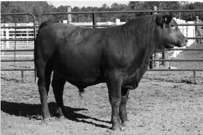
Osborn Legend 125C • Lot 28