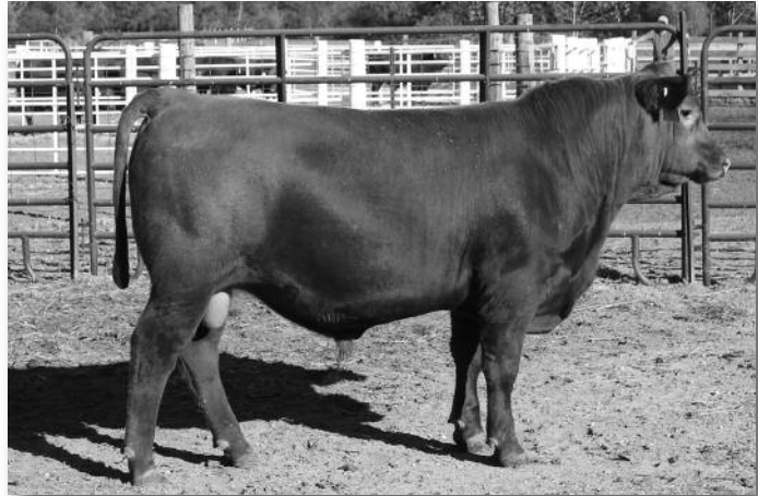
Osborn Legend 1597 • Lot 29