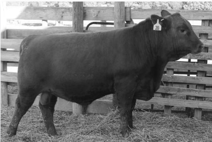
Osborn Legend 126C • Lot 20