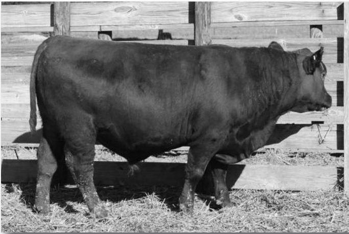
JEM Exclusive 140C • Lot 19