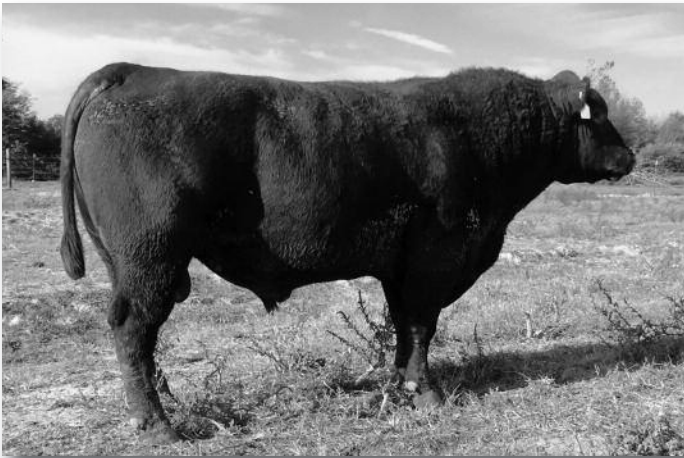
Andras Thunder 2082 • Lot 1