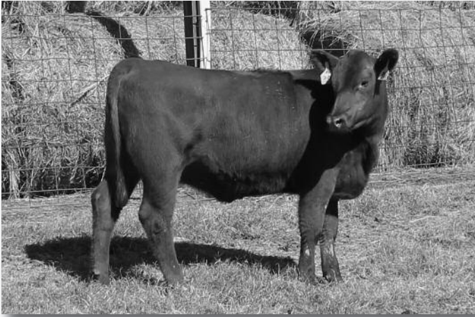
JEM Sophie 115C • Lot 48