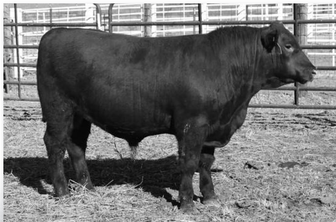
Osborn Director 139C • Lot 17