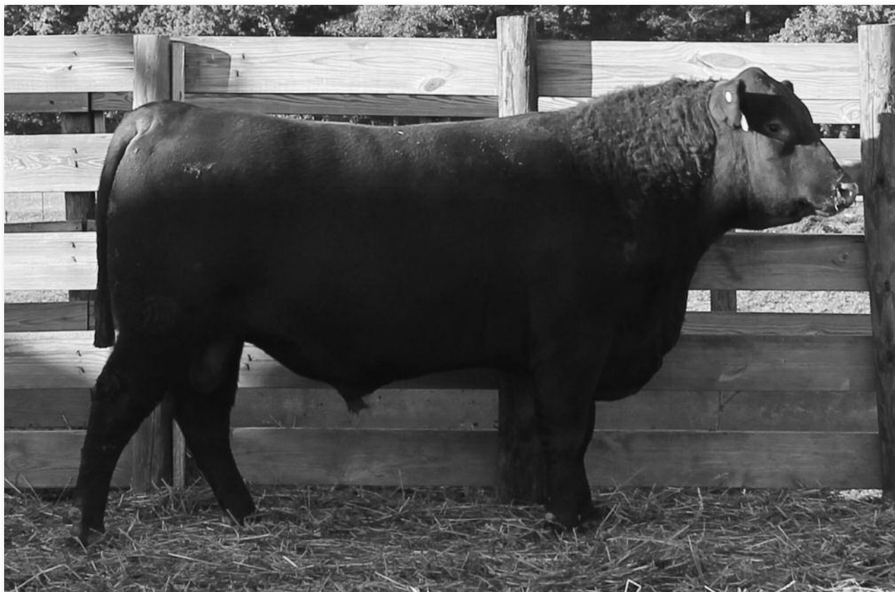
Osborn Thunder 1525 • Lot 2

Lots 2 – 16 are coming two-year-old bulls that are ready to go right to work. They were summered on grasses with no feed added to their diets until the second week of October when we added a small grain ration to their diets in preparation for the sale.