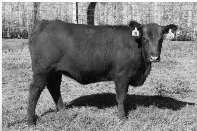
JEM Roxie 120C • Lot 35