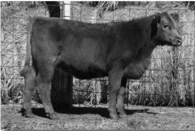
Osborn OSCE 127C • Lot 59