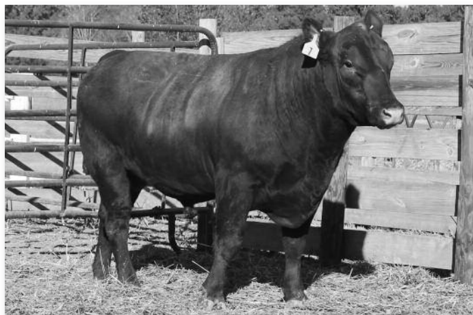
Osborn Thunder 1504 • Lot 7