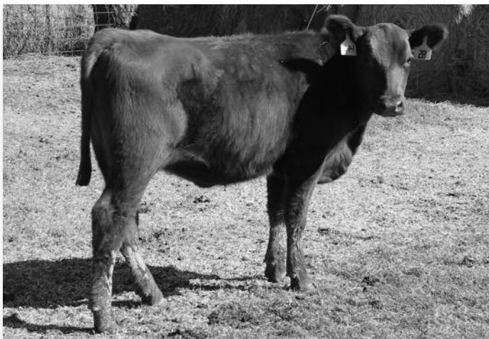
Lot 65 Commercial Heifer