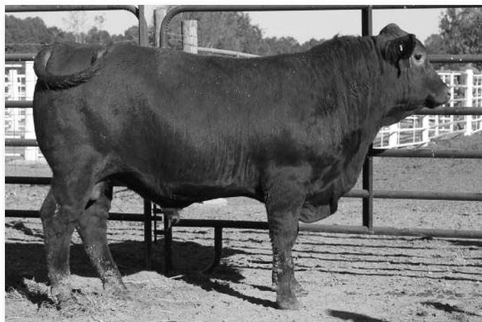
JEM Thunder 130C • Lot 21