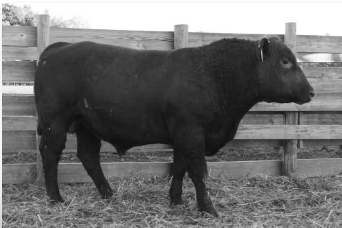
97S 1501 Global • Lot 14