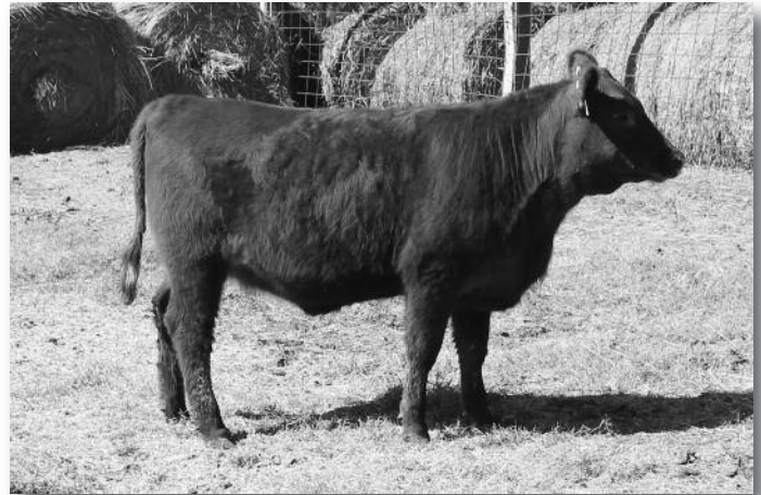
JEM Ms Direction 118C • Lot 38