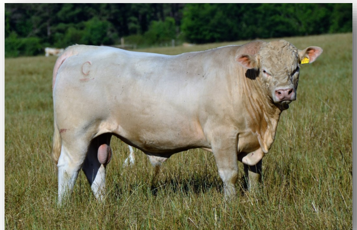
Sells as Lot 7