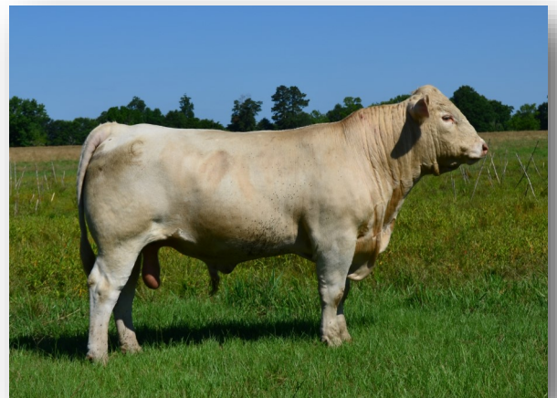
Sells as Lot 4