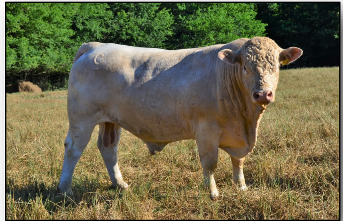
Sells as Lot 6