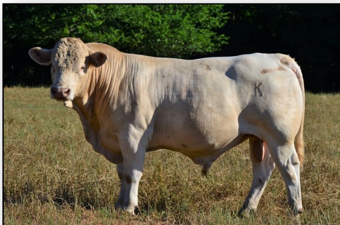
Sells as Lot 31