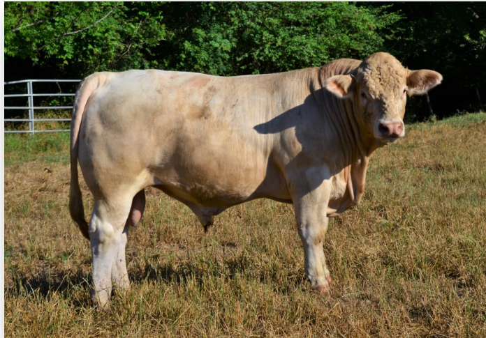
Sells as Lot 29