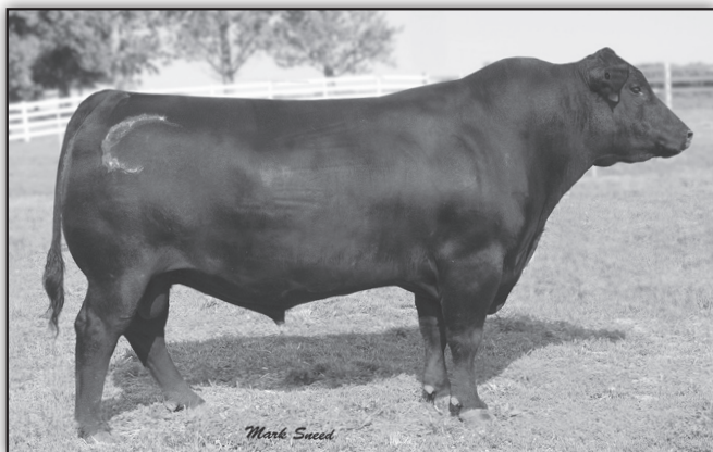
Connealy Stimulus 8419