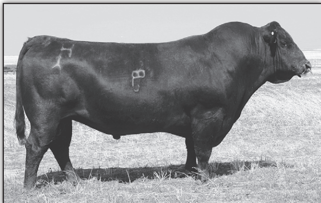
HA Image Maker 0415