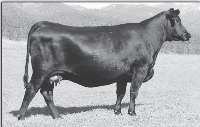
Thomas Lucy 1041 - Famous grandam of Lot 39.