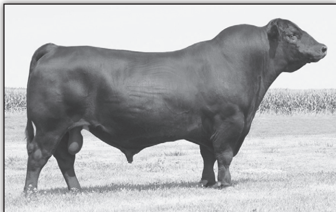
SS Incentive 9J17