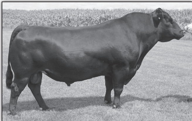
KCF Bennett Absolute

• This heifer sells bred on 8-8-14 to the highest $B Final Answer son in the Angus breed, KCF Bennett Absolute. Erica 301 should make an outstanding producing brood cow.