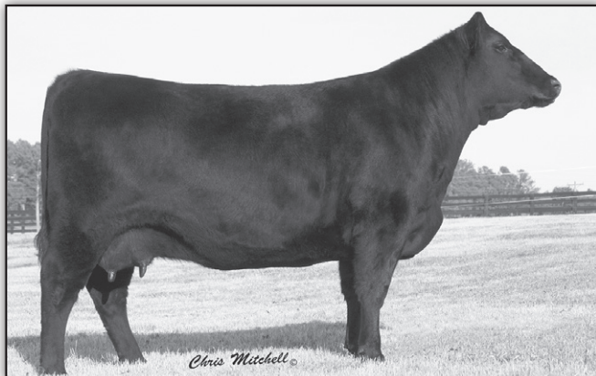
Lemmon Jilt S214 - Donor dam of Lot 98.