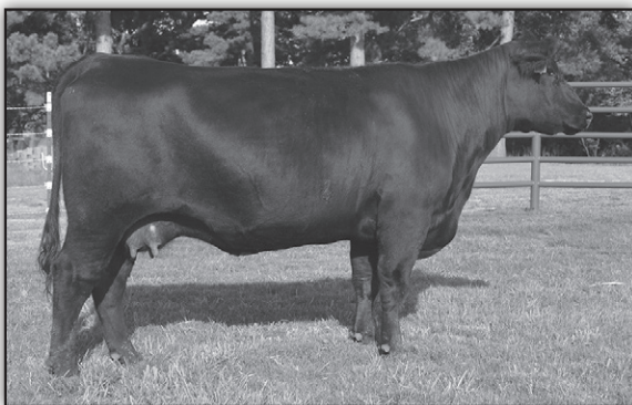
CSC MS Peg X58 - Lot 89