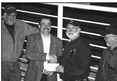
ASU Culinary Scholarship