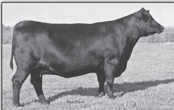
Triple E Blackbird 1018 - Donor grandam of Lot 92.