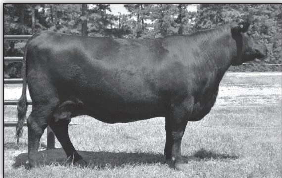
ESF Lady Luck J514 - Lot 90

• LOT 90A SEX: Heifer DOB: 8-3-14 SIRE: SydGen Stacked Deck 1605