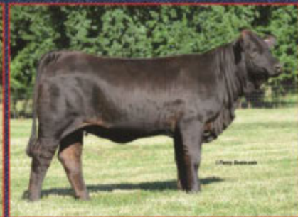
INDIAN SUMMER - KB 119 Smith & Wesson X EMS Smooth Coco DOB 4/6/2013 AI'd to Sugar Britches