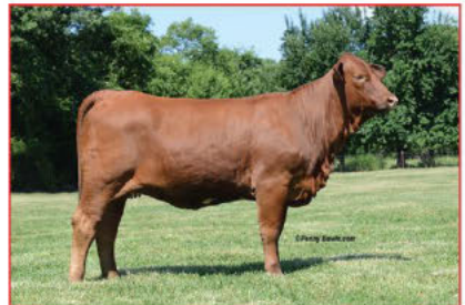
Play It Again