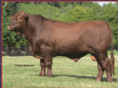
RED DIRT ROAD - KB 230 Smith & Wesson X Perfect Moment DOB 4/8/2013