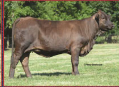
NEON MOON - KB 150 Smith & Wesson X EMS Smooth Coco DOB 5/23/2013 AI'd to Sugar Britches