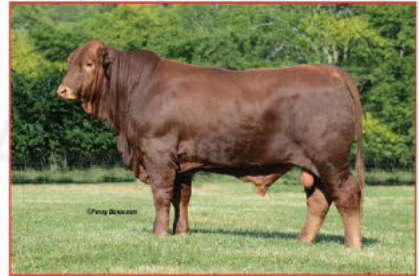
Only In America