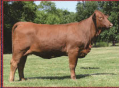
PLAY IT AGAIN - KB 226 Smith & Wesson X 805 DOB 2/28/2013 AI'd to Sugar Britches