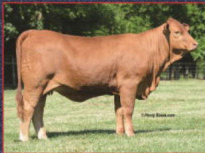
LOST & FOUND - KB 123 Smith & Wesson X EMS Infinitely Buff DOB 4/4/2013 AI'd to Sugar Britches