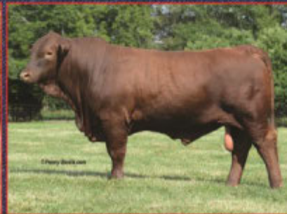
PLAY SOMETHING COUNTRY - KB 227 Smith & Wesson X 573 LE DOB 3/3/2013