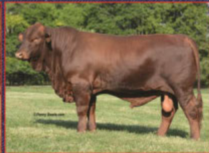
I AM THAT MAN - KB 237 Smith & Wesson X 807 DOB 5/1/2013