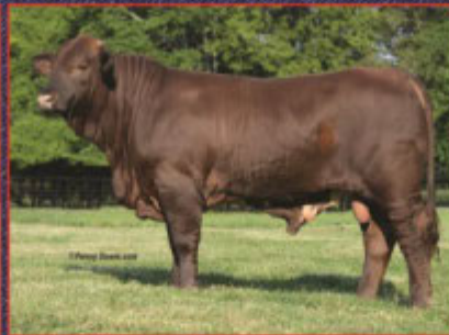
A MAN THIS LONELY - KB 242 Smith & Wesson X Sunset DOB 6/14/2013