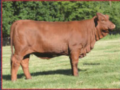
FIREFLY ROSE - KB 31 Smith & Wesson X EMS Pure Jezzabelle DOB 4/4/2013 AI'd to Sugar Britches