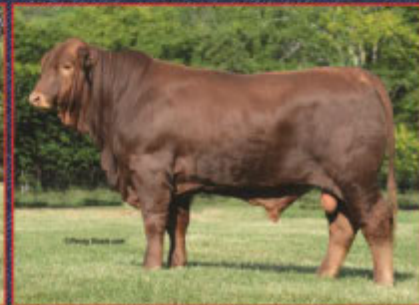
ONLY IN AMERICA - KB 19 Smith & Wesson X EMS Infinitely Buff DOB 3/1/2013