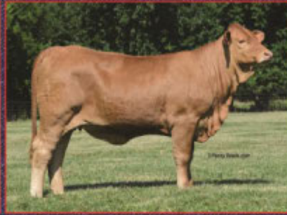
ROCK MY WORLD - KB 30 Smith & Wesson X EMS Infinitely Buff DOB 3/30/2013 AI'd to Sugar Britches