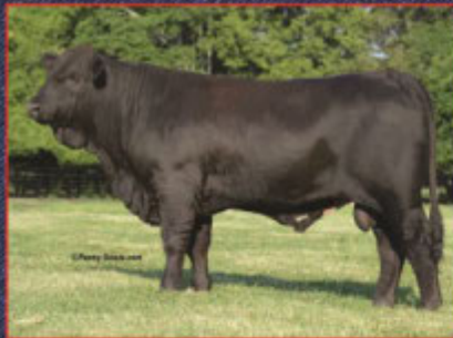
HARD WORKIN' MAN - KB 37 Smith & Wesson X EMS Smooth Coco DOB 4/8/2013