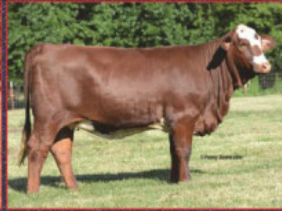
HONKY TONK STOMP - KB 236 Smith & Wesson X EMS Believe In Me DOB 6/3/2013 AI'd to Sugar Britches