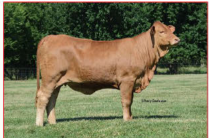
Rock My World