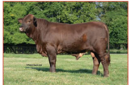
A Man This Lonely