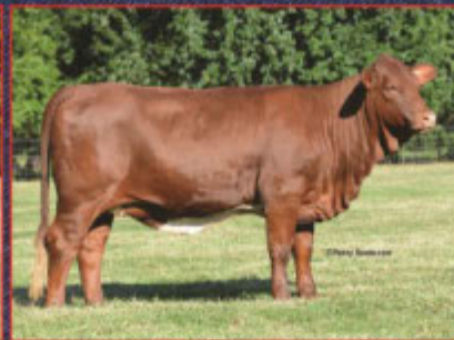
CROSS MY HEART - KB 221 Kix's Britches X CJ Miss 446 DOB 2/12/2013 AI'd to Smith & Wesson