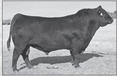
Stevenson Cattleman R142

This female combines several foundation sires of the Angus breed in Riverbend Mile High, Midland, Genesis and Lutton. Pasture exposed to Harvey Network 110. Safe.