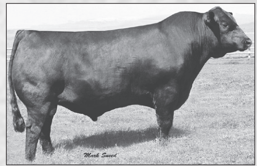
Varsity V Warrior

Solid bred with some of the best Spring Cove genetics. Top 15% WW and YW, Top 20% $W and $F. Pasture exposed to Harvey Network 110. Safe.