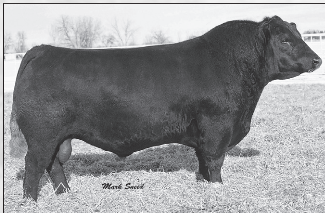
Cole Creek Cedar Ridge 1V