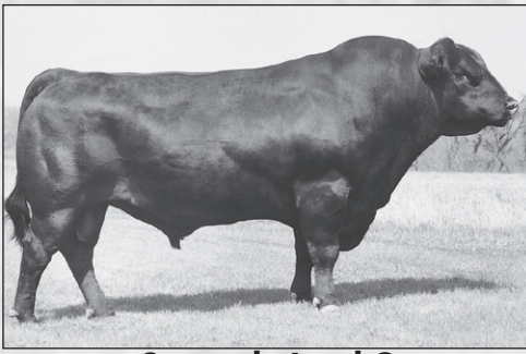
Connealy Lead On