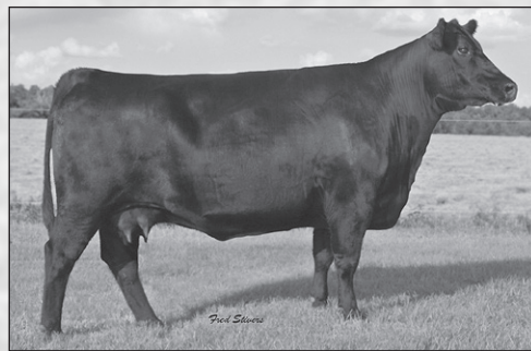
Kahn Blackbird B076 - The sire of Lot 25 traces to this great donor female.