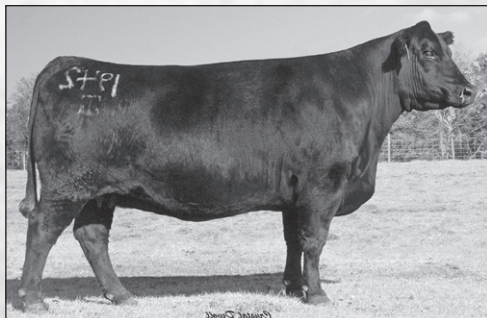
GAR 1407 New Design 1942 - The famous grandam of Lot 28.

A great young cow straight from the BoBo embryo program. The dam of this female is straight from the Gardiner program. Top 2% $G, Top 4% $YG, Top 5% Marbling and $QG, Top 10% RE. AI Bred on 12-1-13 to WMR Infinity then pasture exposed to Harvey Network 110. Safe.