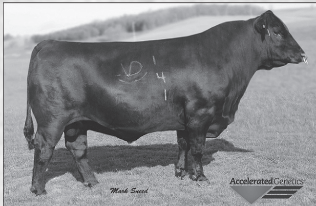
WMR Infinity 141