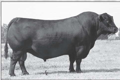
SAV Final Answer 0035 - Service sire of Lot 68.