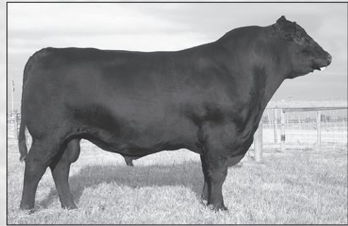
WGA Powerhouse 0423

High volume daughter of S787 out of a New Level dam. Top 20% WW, Top 25% YW, $W and $F. Pasture exposed to Spring Cove Dozer 0336. Safe.