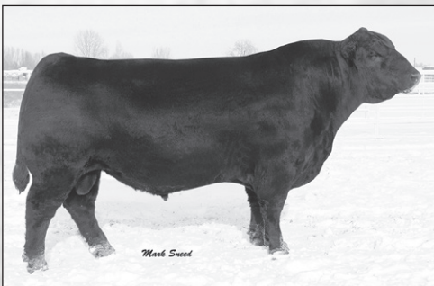
Sitz Upward 307R - Sire of Lot 83.

Another really good producing 878 daughter. Bred AI on 12-1-13 to WMR Infinity then pasture exposed to Claybrook Black Cedar 0155. Safe.