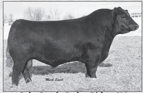
Cole Creek Cedar Ridge 1V - Service sire of many lots selling.

Great pedigree Objective 3J15 daughter out of a Right Time daughter from the Finks program. Bred AI on 12-1-13 to Cole Creek Cedar Ridge 1V then pasture exposed to Claybrook Black Cedar 0155. Safe.