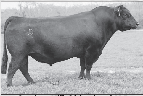
Quaker Hill Objective 3J15 - Sire of Lot 54.