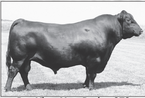
Bon View New Design 878 - Sire of Lots 77 and 78.