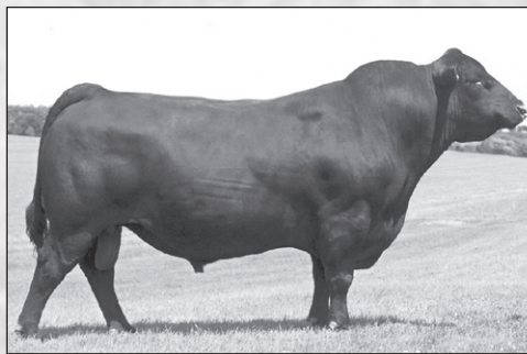
Ironwood New Level