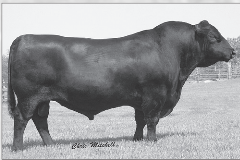
B/R 65R Genesis - Sire of Lots 43, 44, 48 and 53.