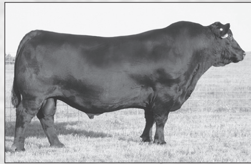
SAV 8180 Traveler 004 - Sire of Lot 93.

A daughter of the bull that led the breed for AI sired calves for three years running, SAV 8180 Traveler 004. Bred AI on 12-1-13 to Basin Excitement then pasture exposed to Claybrook Black Cedar 0155. Safe.