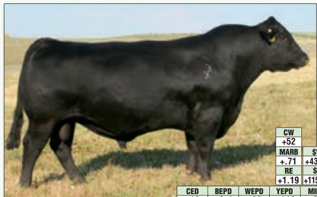
EXAR Upshot 0562B - Sire of Lots 4A, 9A, 18A, 40, 42, 45, 48, 53, 54, 59, 61, 62, 63 and 76.