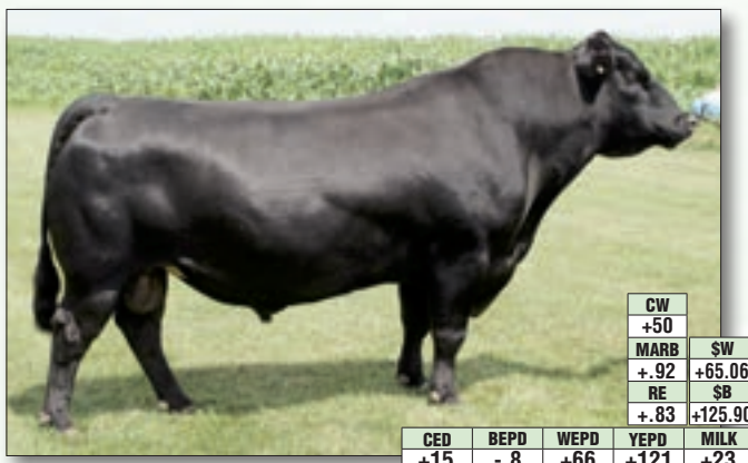
KCF Bennett Absolute - Service sire of Lots 10, 18, 38, 42, 53, 59 and 70.