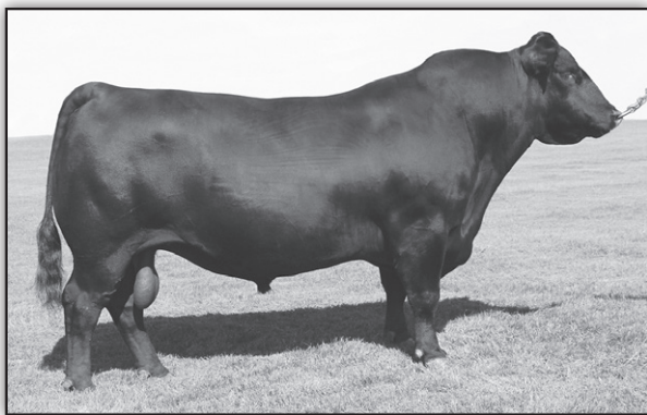
Connealy Final Product