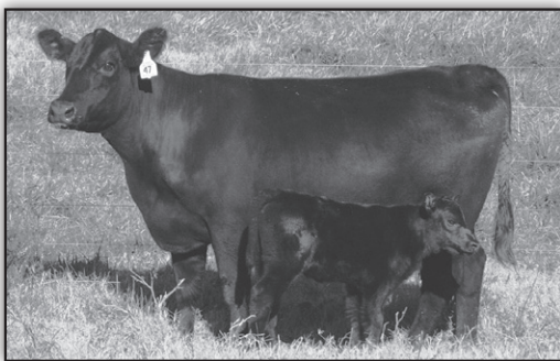
Bubs Josey 33X - Dam of Lot 43.