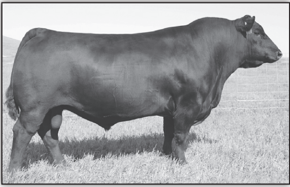
SAV Iron Mountain 8066