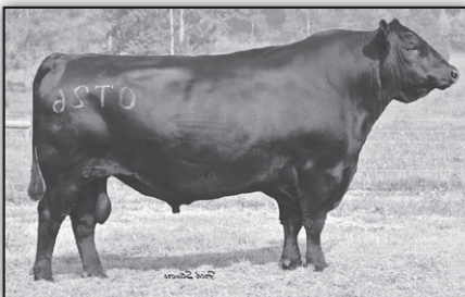
SS Objective T510 0T26