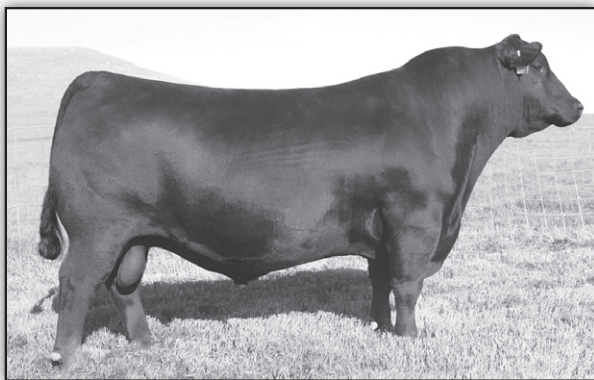
SAV Pioneer 7301