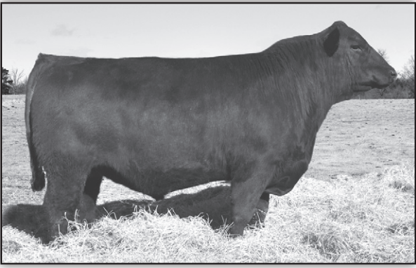
S A Forward 1291 - Lot 22