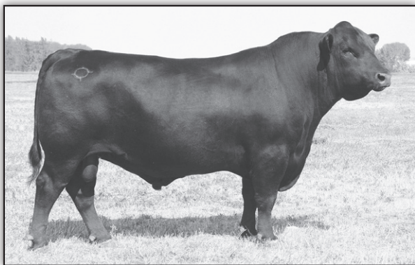
Mytty In Focus