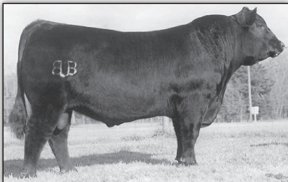
Bubs Crown Prince