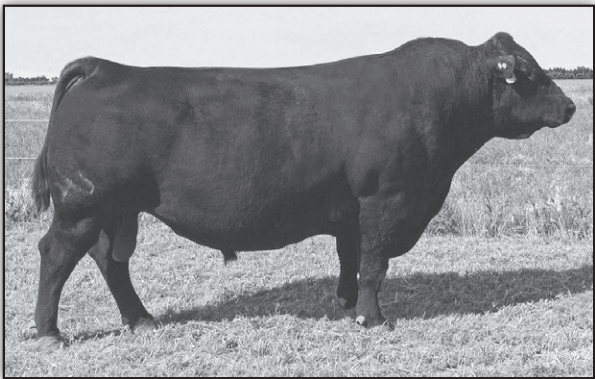
Summitcrest Complete 1P55