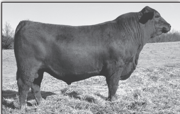
S A Forward 1292 - Lot 21