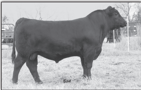
Checkerhill Hoover Dam 210 - Lot 20