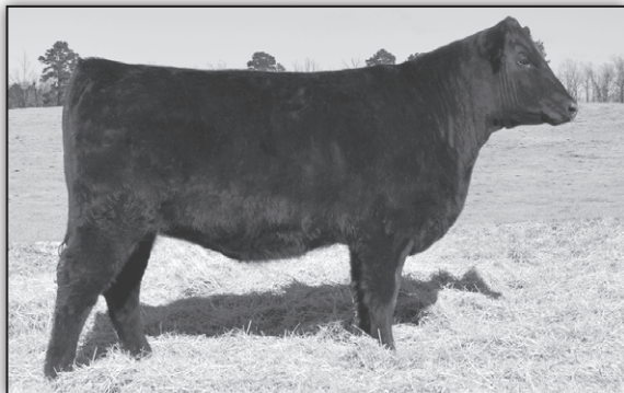
S A Anita 3310 - Lot 36

• A true breeding tool in this female. She is a maternal sister to the $20,000 SydGen Anita 8411. This one could be shown then move on to become a great donor female. • She has a beautiful pattern, great disposition and could possibly be the best heifer ever sold from the Satterfield herd. • Top 10% CW, $W, $F and $B, top 15% WW and YW, top 25% RE and $YG. • Sells open.