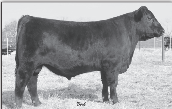
Checkerhill Django 231 - Lot 9