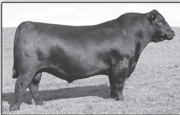
SAV Bismarck 5682