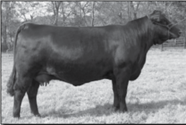
JBOB 5498P Dam of Lot 56.