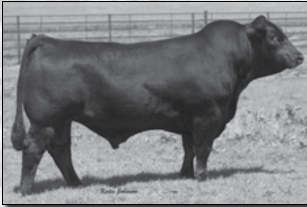
JKGF FUTURE INVESTMENT X037 Sire of Lots 44 and 45.