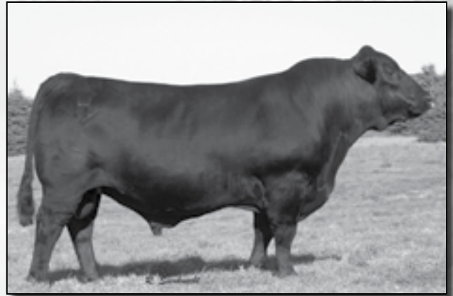
HYEK BLACK IMPACT 3960N Sire of Lot 15.

PE 03-20-14 to 04-05-14 to JKGF Future Investment X037 (AMGV1172364) PE 04-06-14 to 04-10-14 to JCGR Bar GT Colton 292X (AMGV1153520) PE 05-1-14 to 07-19-14 to BCFG Butlers Impact 549U (AMGV1058573) Due January 2015