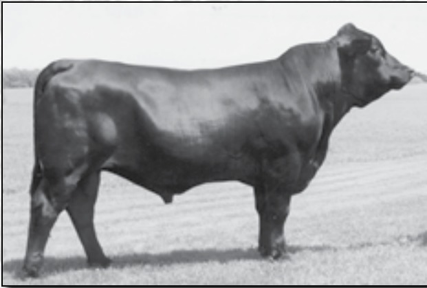
JBOB CAROLINA FORTUNE 2564JET Sire of Lot 9.