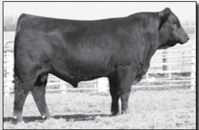
CTR GOOD NIGHT 715T Sire of Lot 16.

Lot 16A HB/HP 50% Balancer Bull (AMGV1296579) BD: 10-27-14 BW: 80 TT: 1442B Sire: CCRO CCross Top Shelf 9100W ET (AMGV1120887)