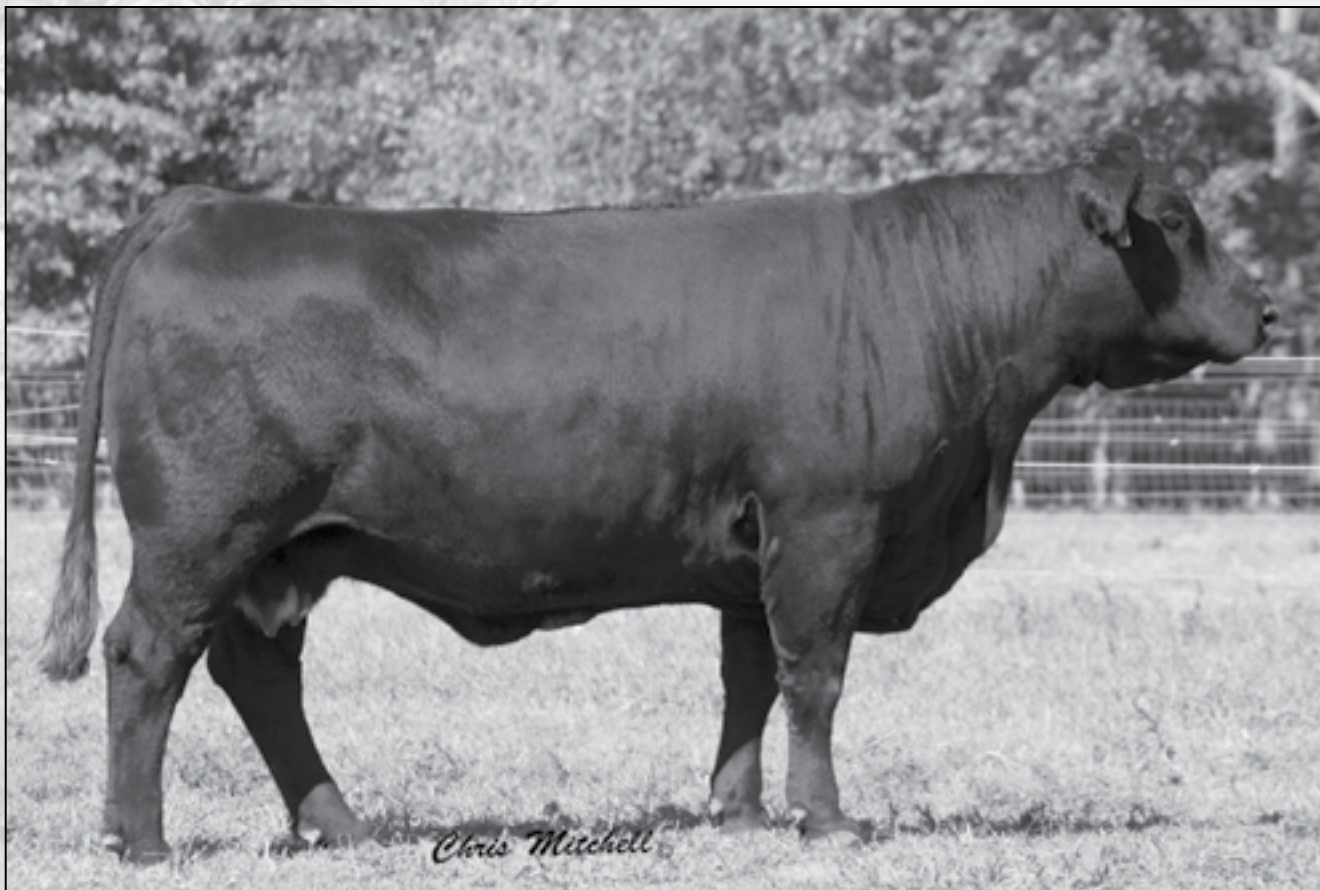
JBOB 5251P Dam of Lots 1 and 2.