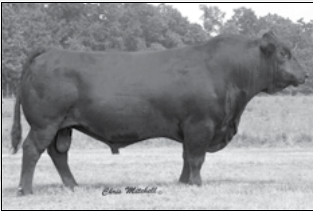
JBOB CAROLINA MASTER 4231M ET Sire of Lot 10.