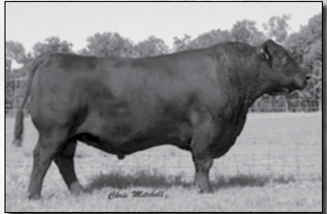
PARTISOVER ANCHOR 948 Sire of Lots 3 and 7.

Lot 3A HB/HP 50% Balancer Heifer (AMGV1296572) BD: 09-24-14 BW: 74 TT: 1435B Sire: CCRO CCross Top Shelf 9100W ET (AMGV1120887)