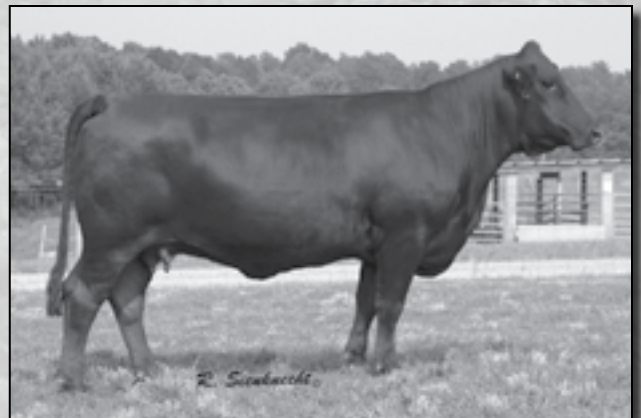
JBOB 3952L ET Dam of Lot 8.

A direct daughter of JBOB 1335G, a premier donor female from the C-Cross Cattle Company program. 8334U has four calves on record with a BW ratio of 97 and a WW ratio of 105. This strong female sired by Partisover Anchor is one of our favorites at Clinch Mountain. PE 03-20-14 to 04-05-14 to JKGF Future Investment X037 (AMGV1172364) PE 04-06-14 to 04-10-14 to JCGR Bar GT Colton 292X (AMGV1153520) PE 05-1-14 to 07-19-14 to BCFG Butlers Impact 549U (AMGV1058573) Due February 2015