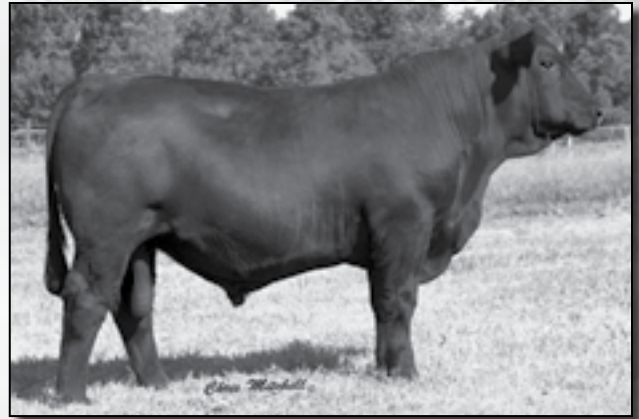
CCRO CAROLINA EXCLUSIVE 1230Y Sire of Lots 38 and 39.

A daughter of Exclusive 1230Y out of the JBOB 11N maternal cow family. She ranks in the top 4% for CW, top 5% for YW, and the top 10% for WW. Dam sells as Lot 11. Sells open and ready to breed.