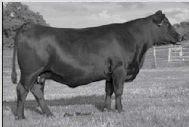
CCRO 0851X Full sister to Lot 1.

An outstanding young female out of the JBOB 5251P donor female sired by Post Rock Silver 233U1. This cow family is one of the strongest cow families that was in the C-Cross Cattle Company program. JBOB 5251P was the high selling female in the C-Cross Cattle Co production sale in 2011. 1157Y ranks in the top 1% for WW, YW, & CW and the top 2% for FPI index. AI'd 03-29-14 to JKGF Future Investment X037 (AMGV1172364) PE 04-14-14 to 07-19-14 to BCFG Butlers Impact 549U (AMGV1058573) Due February 2015