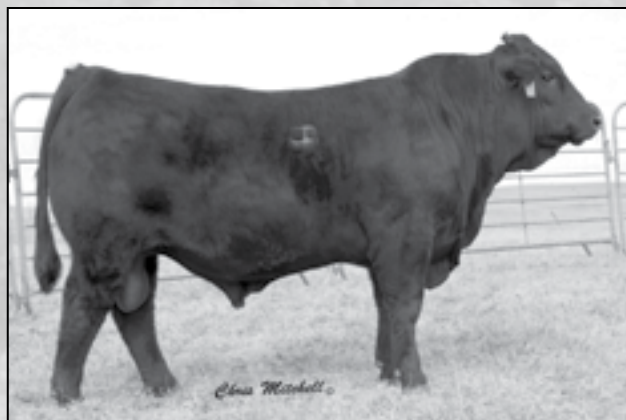
DCSF POST ROCK SILVER 233U1 Sire of Lot 2.