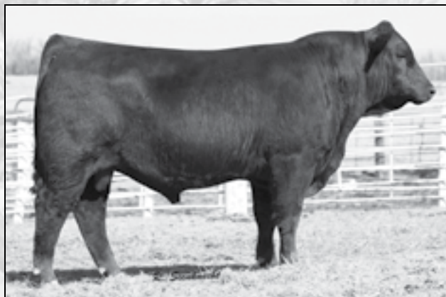
CTR GOOD NIGHT 715T Sire of Lot 33.