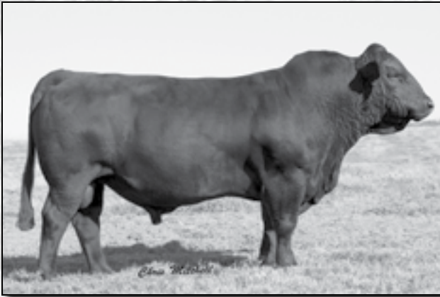
Jkgf TRENDSETTER 55R ET Sire of Lot 21.