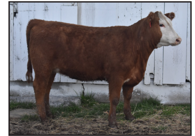
GREGORY POLLED HEREFORDS