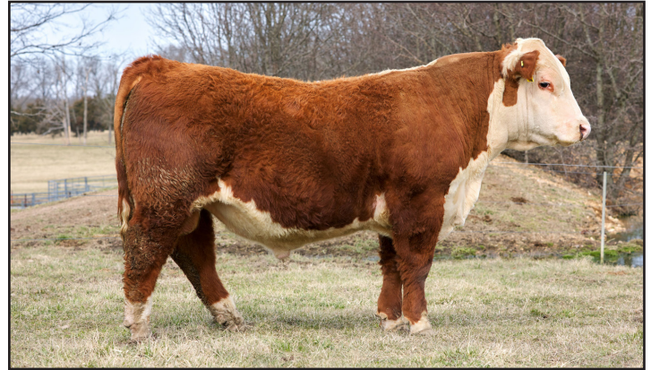
Lot 11 - MH 1054 PROPHET 8340 ET