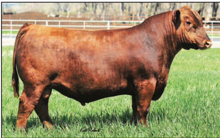
Herd Sire - LSF MEW PLATINUM 5660C