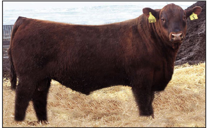
Herd Sire - LSF SRR TYSON 3025A

• Extra high Marbling with moderate Birth Weight. Outstanding growth and carcass bull. BW: 80 ADJ WW: 713 • Top 3% for WW; Top 4% for MARB.