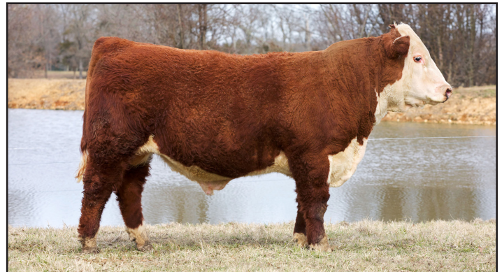
Lot 17 - MH 196T PROPHET 9042