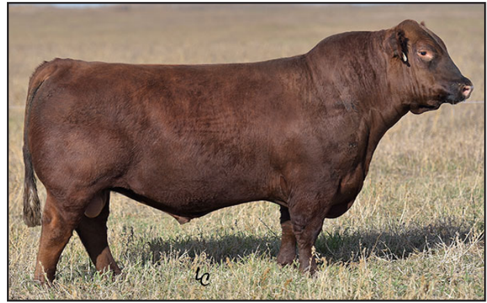
Herd Sire - BROWN BLW STATISTICIAN B5240