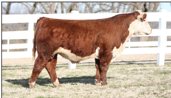
Lot 4 - BB 6153 BLUEPRINT 104G