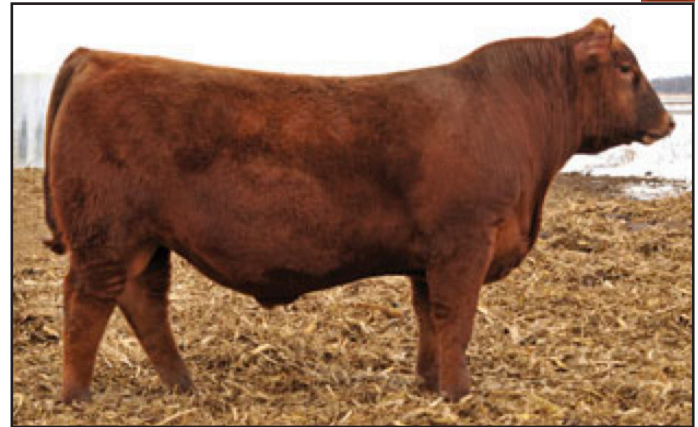
Herd Sire - HXC DECLARATION 5504C