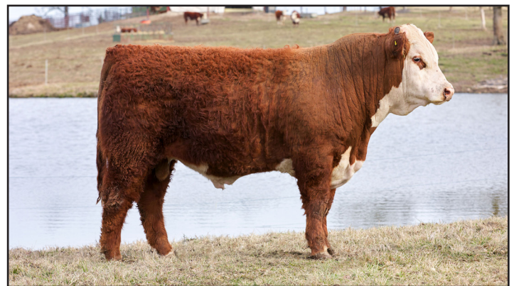
Lot 13 - MH 028X CATAPULT 322 9750