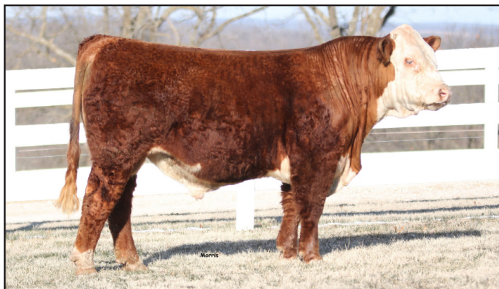
Lot 3 - BB 2504 SENSATION 309F ET