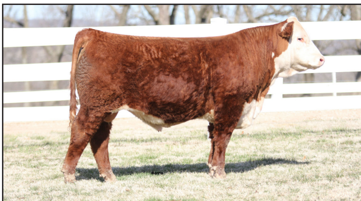
Lot 7 - BB 6011 MANHATTEN 113G